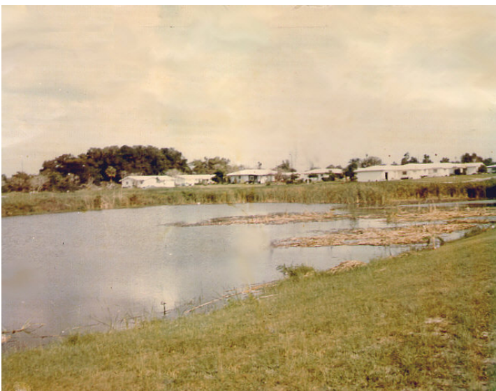
Old picture of Grove Lake, looking southward

As stated in the previous letter, the monthly charge by the maintenance company (Aquatic Systems) is $163.00, up from last year. With 11 out of 15 property owners willing to participate (one waived), I am requesting individuals contribute $178.00/year towards this yearly contract which begins November 1st 2006. Should additional residents decide to contribute later, I will refund any excess collected.