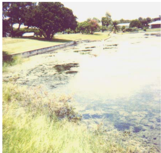
It looked bad but it smelled even worse.