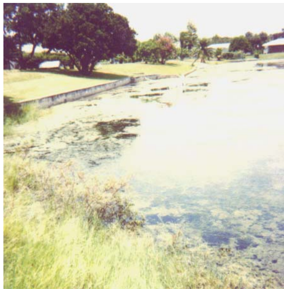
It may have looked bad but it smelled worse.

There is nothing to restrict anyone from fishing here, although it is up to us to protect our investment.