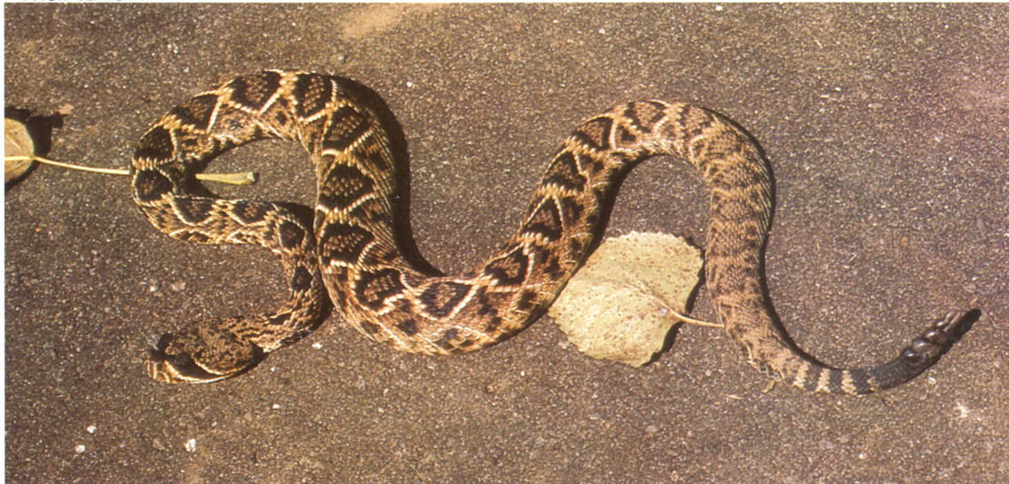
DIAMONDBACK RATTLESNAKE a 3½ foot long specimen (above)